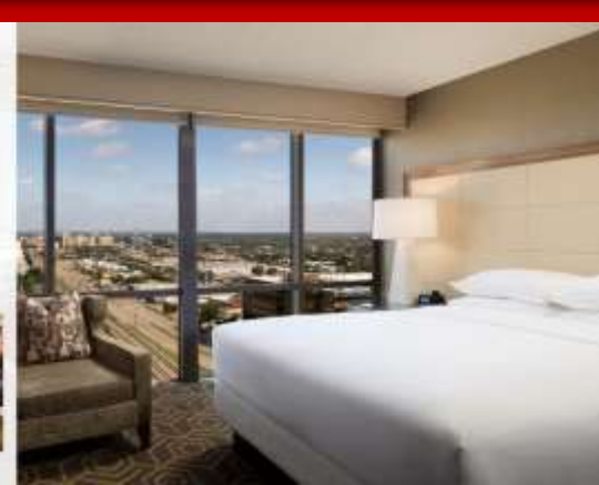
To view the rooms and conference rooms, please click the link: https://spark.adobe.com/page/feKBRYcfhWwUD/